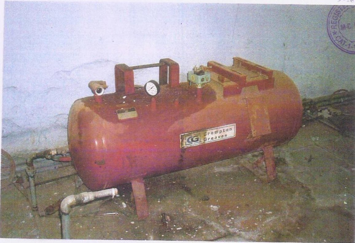
9) PHOTO SHOWING AIR COMPRESSOR