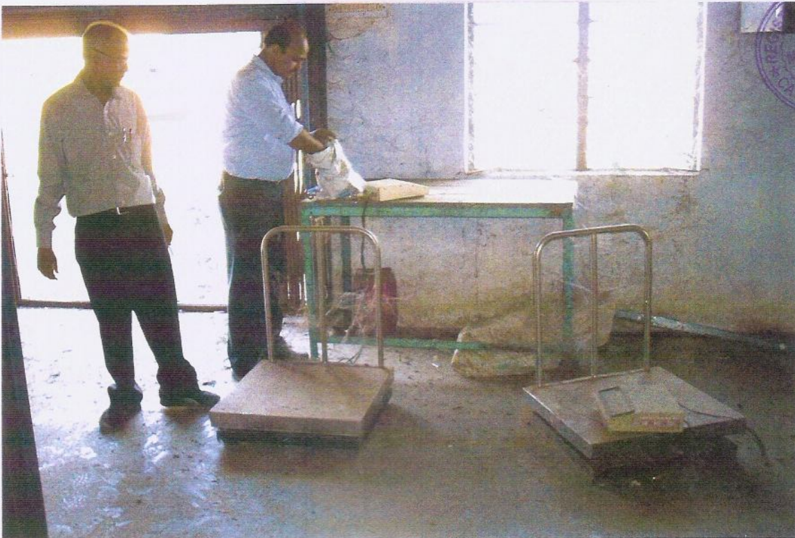
10) PHOTO SHOWING WEIGHING SCALE